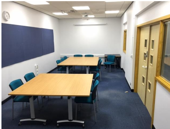
Meeting Room 1